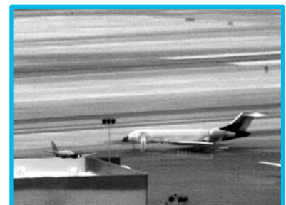
NARROW WITH DIGITAL ZOOM